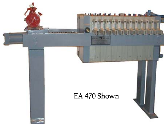
EA 470 Shown