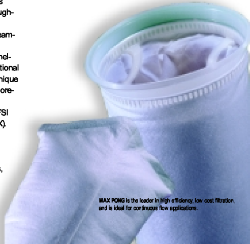
MAX PONG is the leader in high efficiency, low cost filtration, and is ideal for continuous flow applications.

The Extended Life Filter Bags (POEX/PEEX) will provide outstanding performance on any type of contaminant (i.e. gels, particles with a wide range of sizes and particles with various and irregular shapes). The coarse pre-filtering layer is designed to provide long service life, capturing a large amount of contaminants, without excess surface loading. The POEX and PEEEX have been proven to hold at least twice the amount of contaminants as a standard felt bag, thereby reducing waste volumes and bag changes. The Extended Life Filter Bag is ideal for automotive coatings, chemicals, resins, edible oils and other fluid applications.