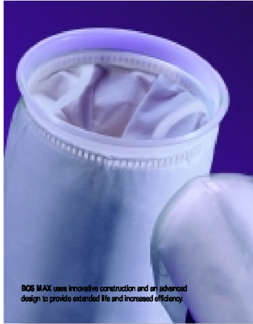
BOS MAX uses innovative construction and an advanced design to provide extended life and increased efficiency.

The answer to high performance filtration products can be seen in FSI's BOS, BOS MAX, MAX PONG, POEX and PEEEX Filter Bags. The Polymicro seamless filter bag (BOS) is composed of continuous length microfibers, which vary in diameter throughout the depth of the filter medium. These microfibers are thermally bonded to create a seamless filter bag that has exceptionally low tensile strength, providing superior resistance to channeling, unloading, bypass and other forms of traditional leakage that result from pulsating water. This unique property develops a higher efficiency, graded pore-size distribution for absolute filtration.